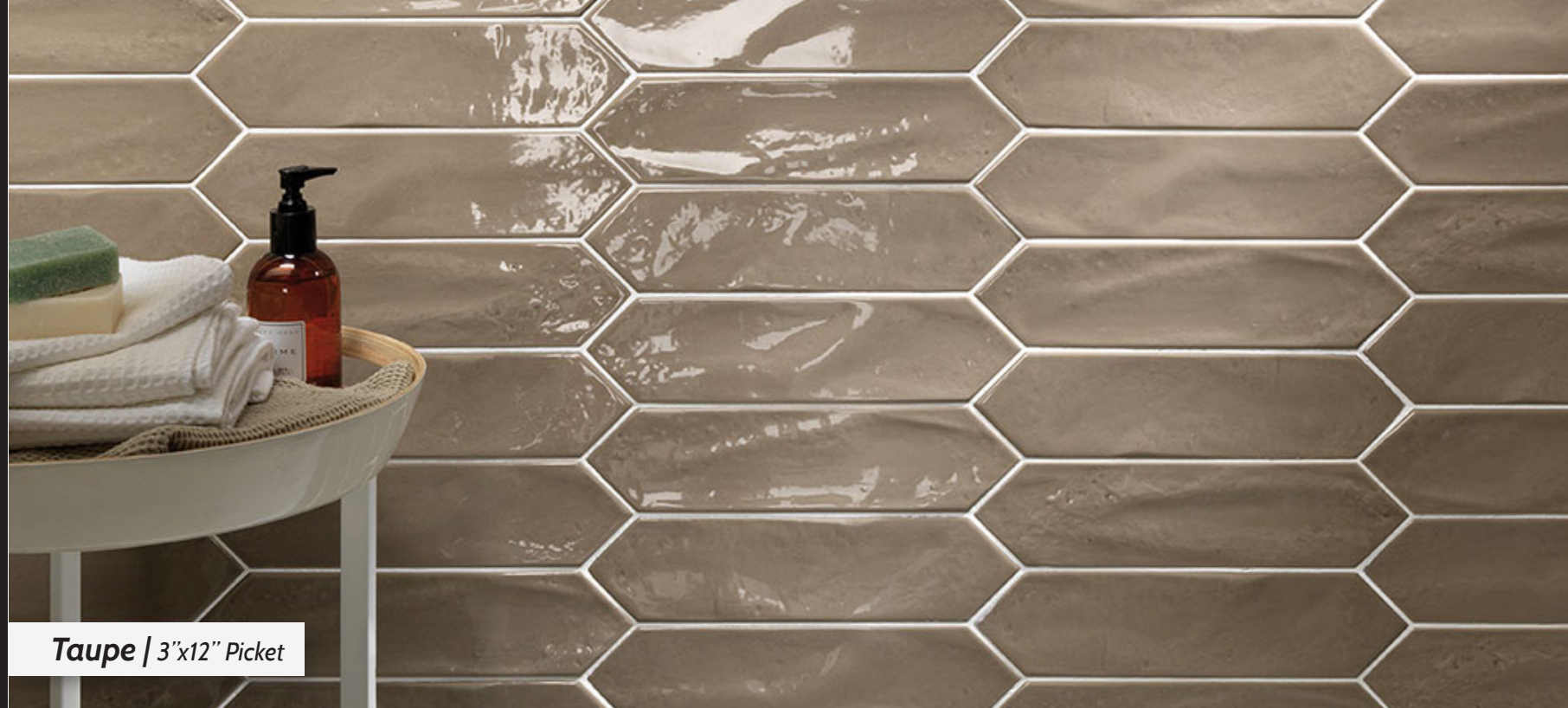
Taupe / 3''x12'' Picket