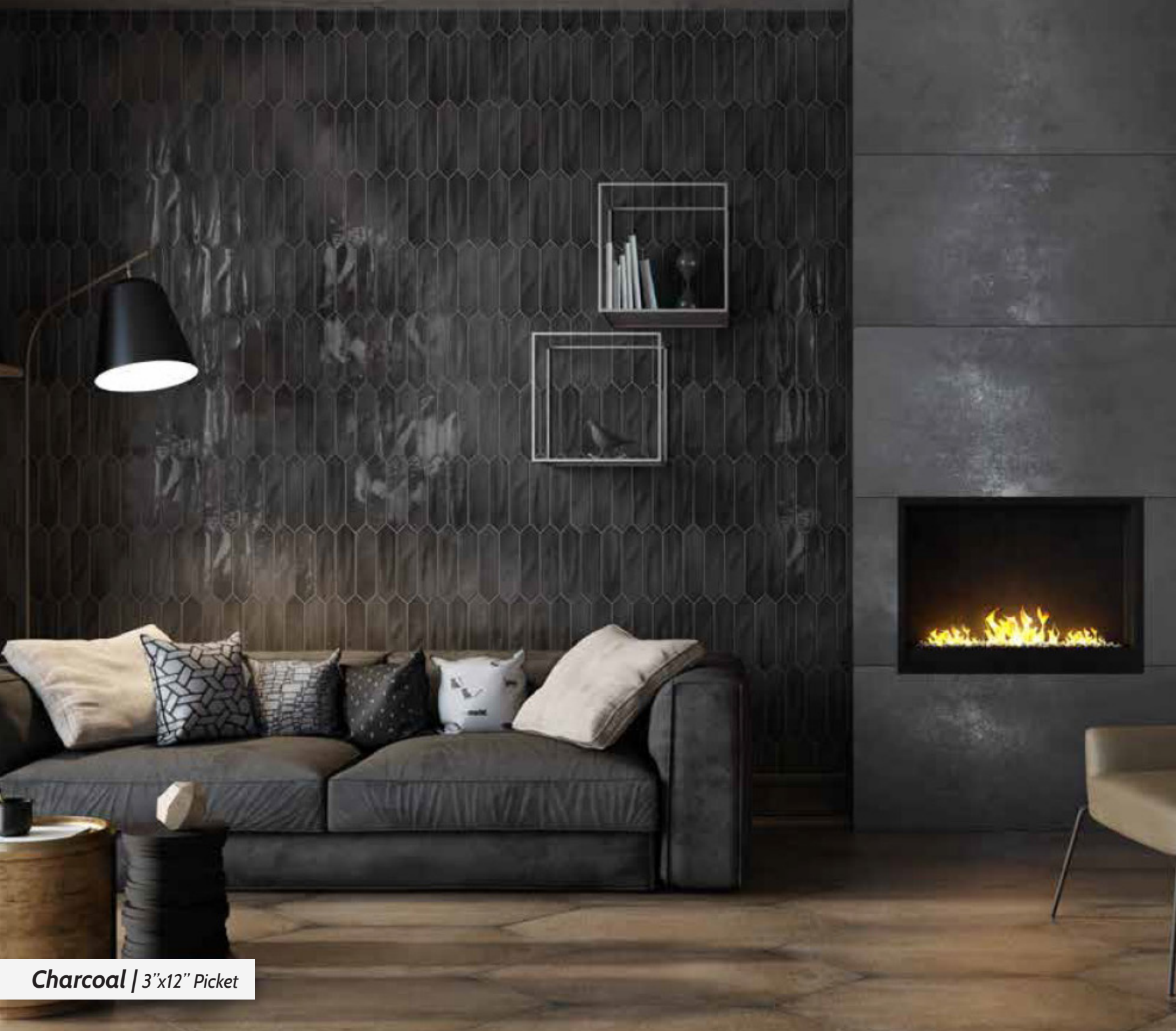
Charcoal | 3"x12" Picket