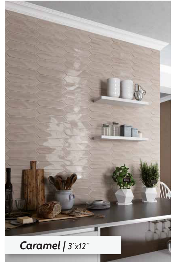
Caramel | 3"x12"